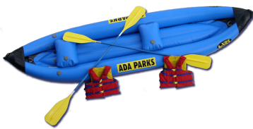
2 Person Inflatable Kayak

Kayak + 2 paddles + 2 vests $50.00 + sales tax