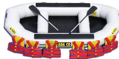
6 Person Raft

Raft + 2 paddles + 6 vests $85.00 + sales tax