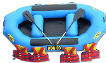
4 Person Raft

Raft + 2 paddles + 4 vests $75.00 + sales tax