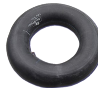
Tubes for Sale

Kayak + 2 paddles + 2 vests $50.00 + sales tax